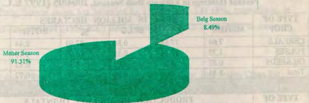
Figure 1. Estimates of total area under major crops for private holdings in Ethiopia for both seasons 2004/05(1997 E.C.)

Out of the total output of major crops (both Meher and Belg Seasons) of 2004/05 (1997 E.C.) the total area under Cereals accounted for about 8.44 million hectares (78.73%) with a production of 106.55million quintals (84.73%).